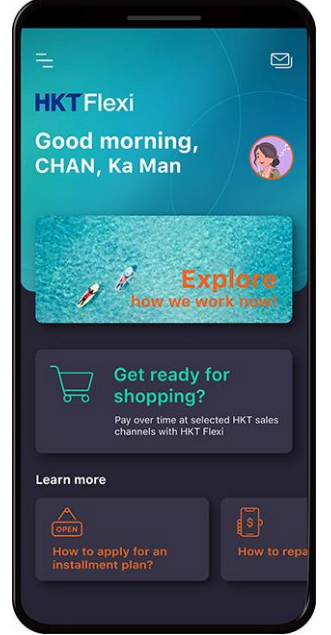
The HKT Flexi App features a simple and user-friendly interface, delivering an innovative digital financing experience.